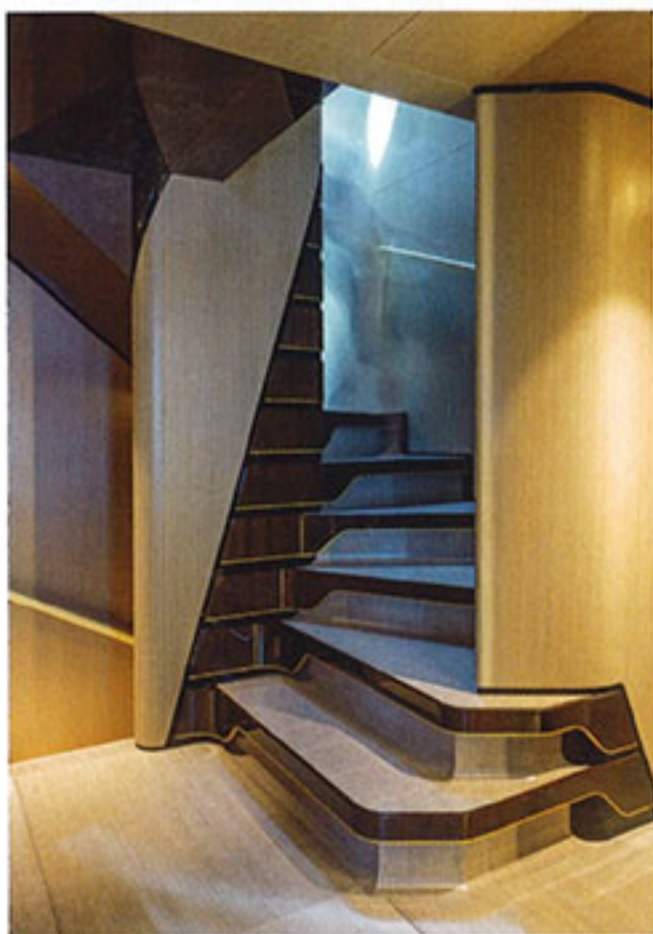
BOTTOM, THE 'BEACH CLUB', WITH ACCESS TO THE SWIMMING PLATFORM